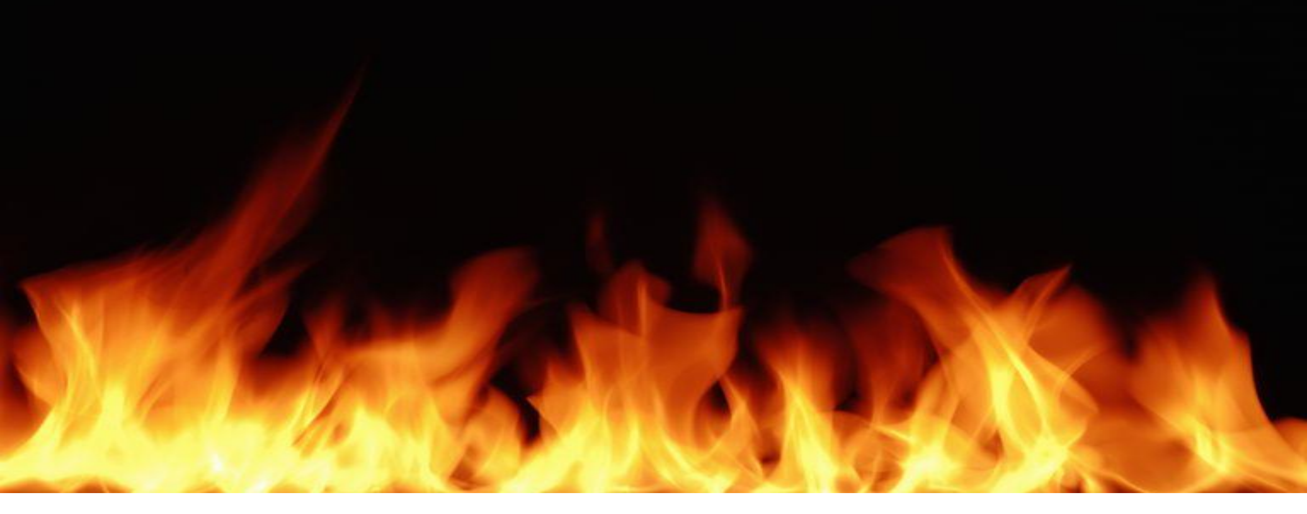
FLAMES: DANGER, MELT, DESTRUCTION, EMERGENCY, FIREPLACE, INFERNO, SHADOW, PHOENIX, FIRE, CANDLE LIGHT, SMOKE