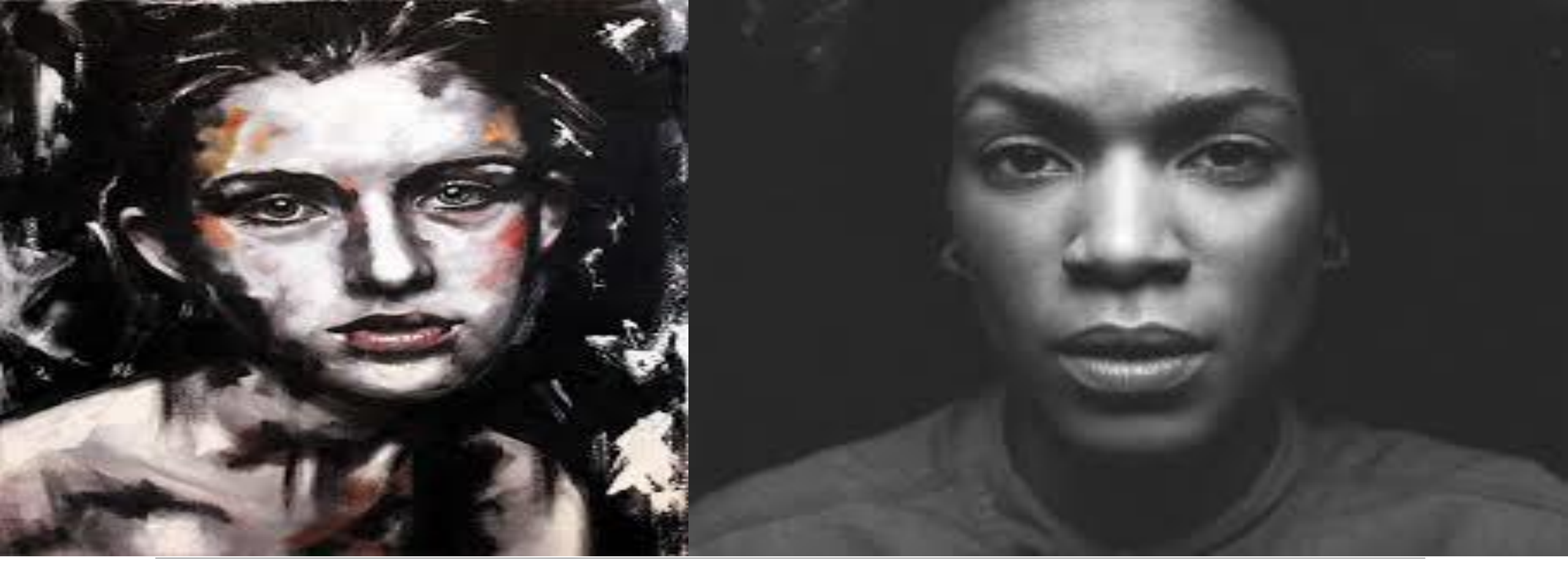
FIQURE(S): PORTRAIT, LIFE, HAND, SILHOUETTE, FACE, POSE, SKIN, POSTURE, FORM, EXPRESSION.