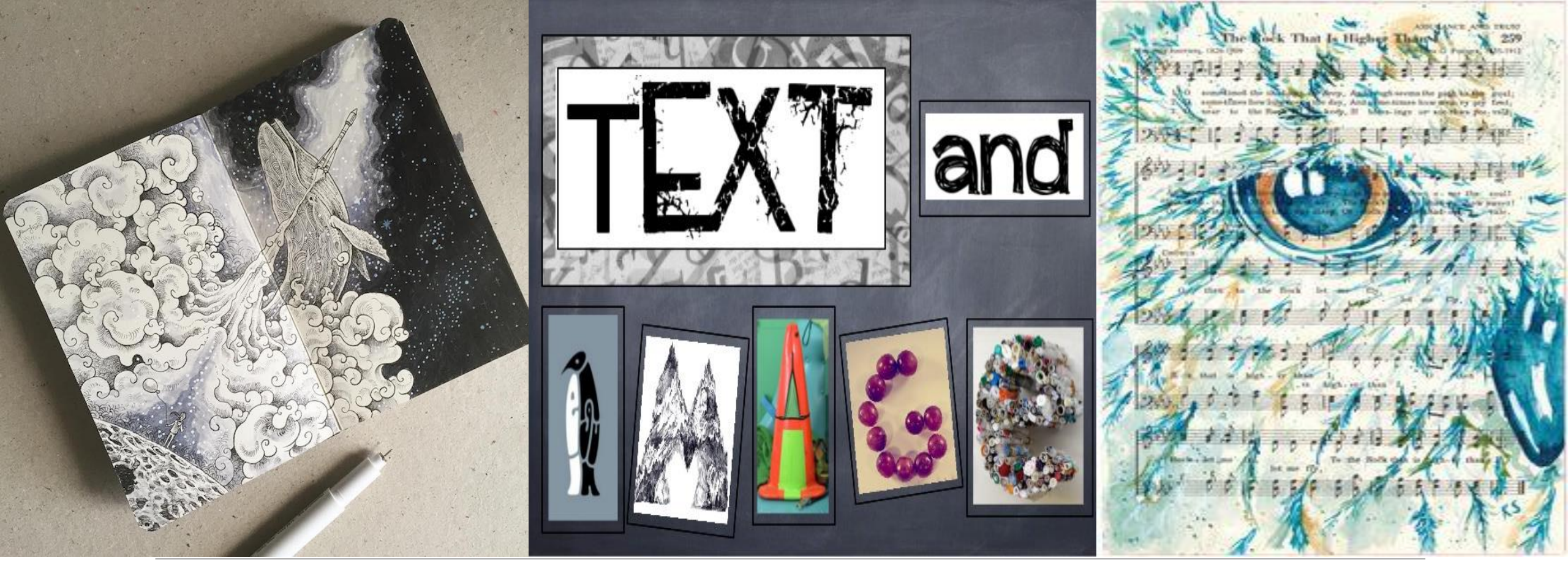
PRESENTATION: A2 PIECES OF PAPER, SKETCHBOOKS, SMALL PIECES OF WORK THEN MOUTED, MAKE YOUR OWN SKETCHBOOK????