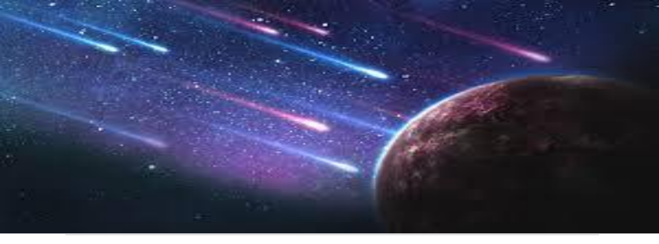
SPACE: SCI-FI, ROCKETS, ASTRONAUT, LAUNCH, SUIT, STATION, BIG BANG, MOON, STARS, SUN, SOLAR SYSTEM.