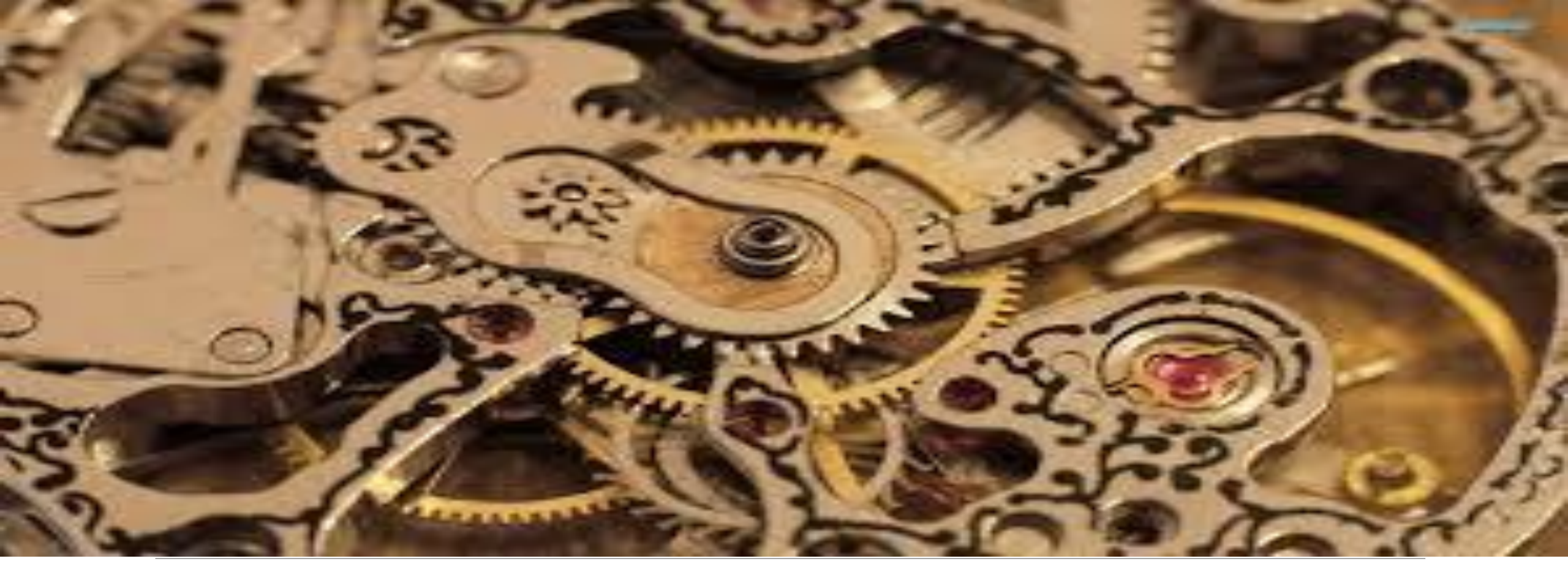
MECHANISM: MACHINE, GEARS, FACTORY, INDUSTRIAL, PRECISION, COGS, ENGINE, MOTION, FORCE, HYBRID.