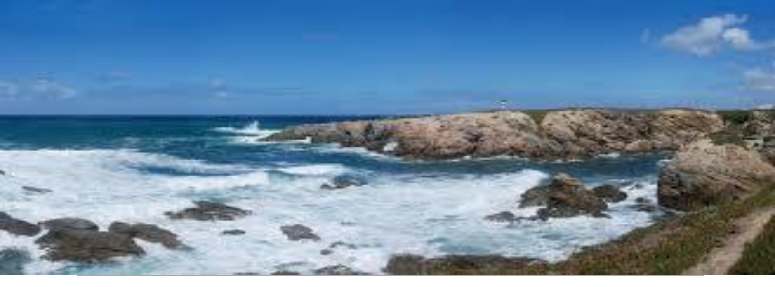
COAST: HOLIDAY, FISH, STORM, CLIFFS, SAND, WILDLIFE, BEACH, EROSION, BOATS, BIRDS.